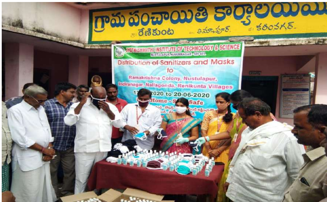
Jyothishmathi Institute of Technology and Science, NSS Unit organized “Distribution of face masks & Hand sanitizers” in Renikunta Village on 19.06.2020.