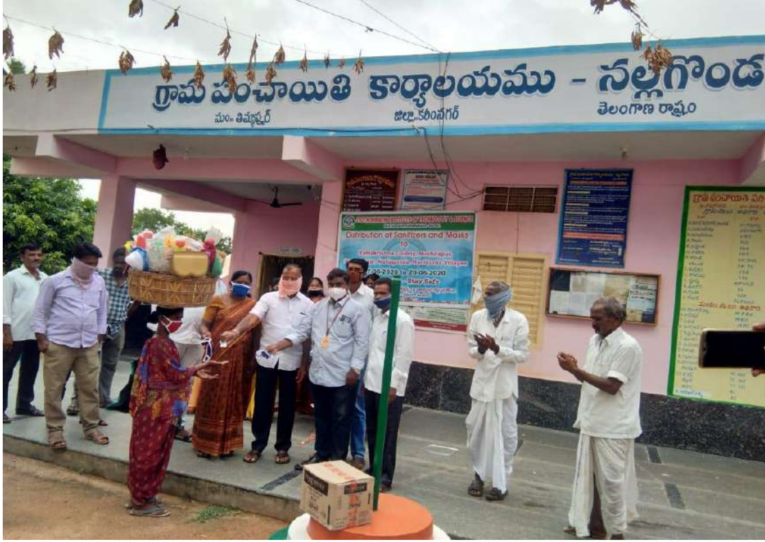
Jyothishmathi Institute of Technology and Science, NSS Unit organized “Distribution of face masks & Hand sanitizers” in Nallagonda Village on 18.06.2020.