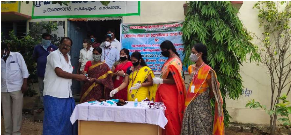
Jyothishmathi Institute of Technology and Science, NSS Unit organized “Distribution of face masks & Hand sanitizers” in Indira Nagar Village on 18.06.2020.