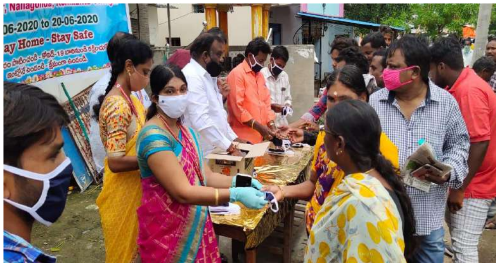
Jyothishmathi Institute of Technology and Science, NSS Unit organized “Distribution of face masks & Hand sanitizers” in Nusthulapur Village on 20.06.2020.