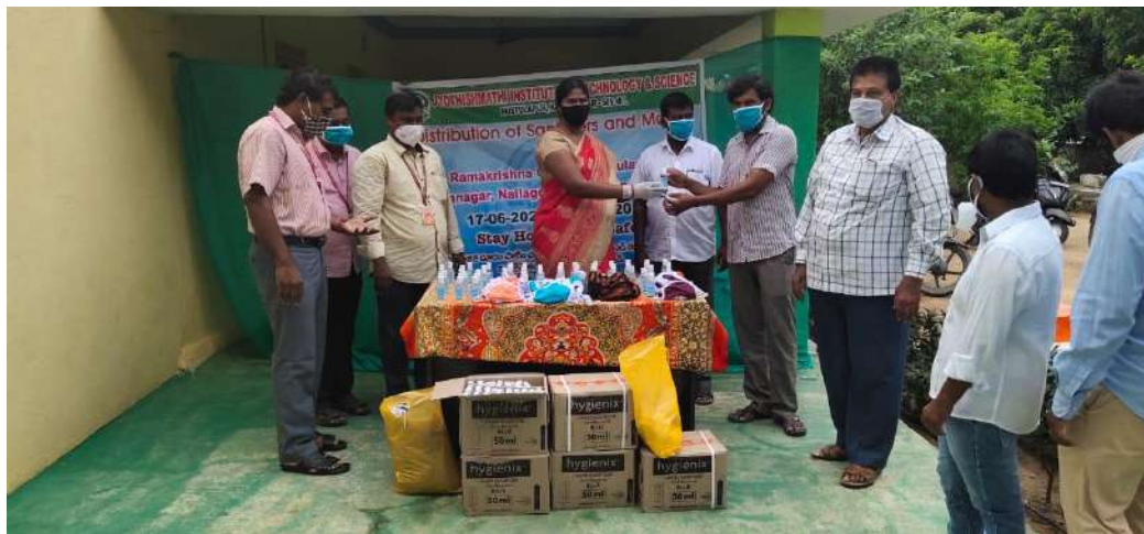
Jyothishmathi Institute of Technology and Science, NSS Unit organized “Distribution of face masks & Hand sanitizers” in Rama Krishna Colony Village on 17.06.2020