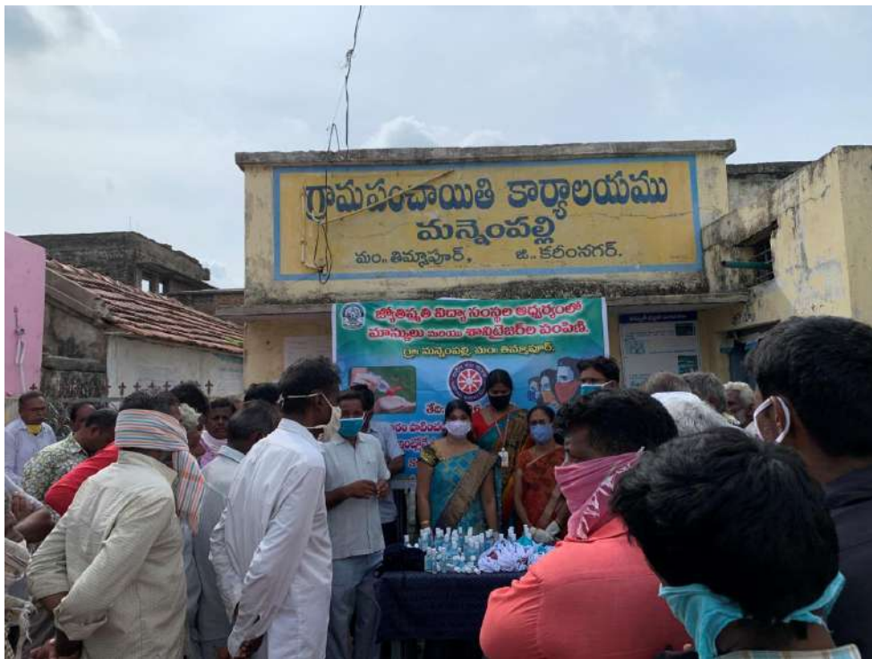
Jyothishmathi Institute of Technology and Science, NSS Unit organized “Distribution of face masks & Hand sanitizers” in Mannempally Village on 26.06.2020.